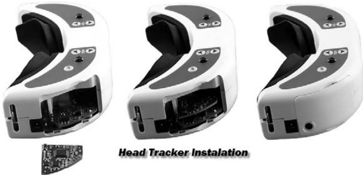
Head Tracker Instalation

Refer to head tracker module manual for up to date and detailed menu setup instructions. For individual radio setup instructions please visit our head tracking support forum at www.FPVlab.com Forum: Sponsors Gate/Fat Shark/Head tracker radio support.