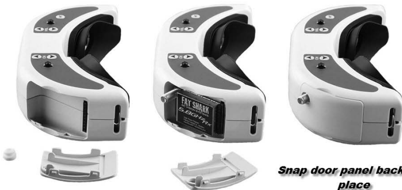
Remove door panel Remove hole plug