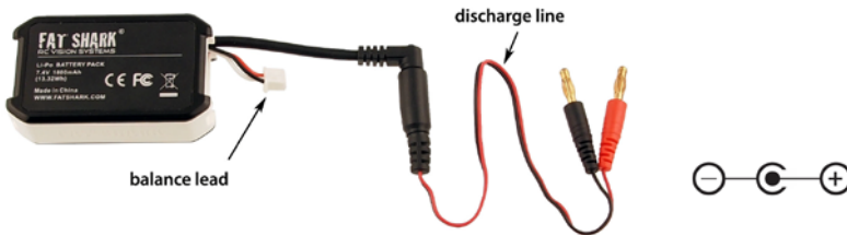
Connection to Standard RC Chargers

Note (2): If battery becomes fully discharged or accidentally shorted, an internal safety circuit will trip. To reset the battery, tap 9V direct to the barrel connector via the discharge adapter cable's banana connector (black = GND, red = 9V). This will instantly reset the battery and it can be recharged as normal.